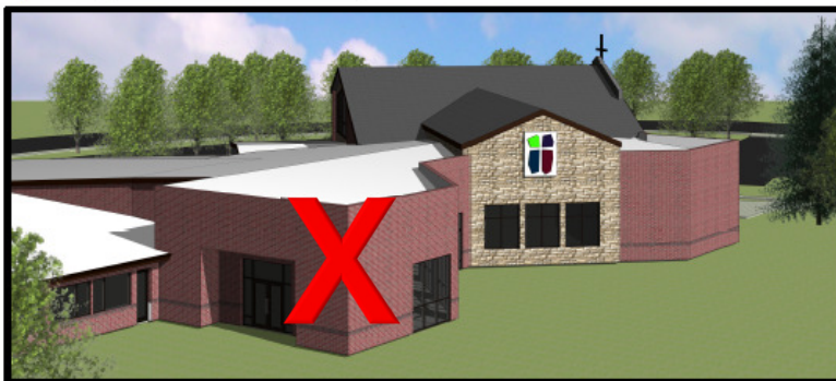
2 PERSPECTIVE #6