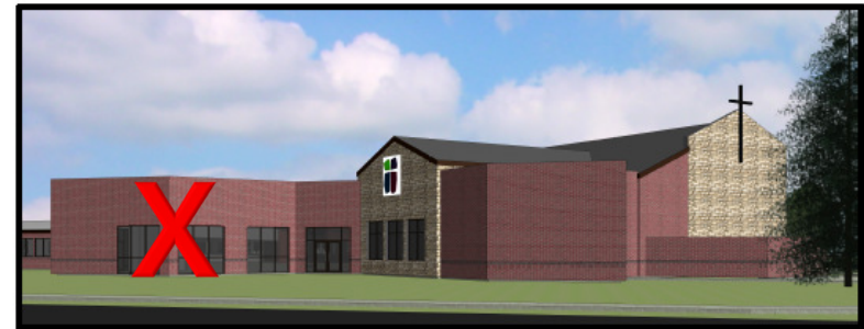
3 PERSPECTIVE #7