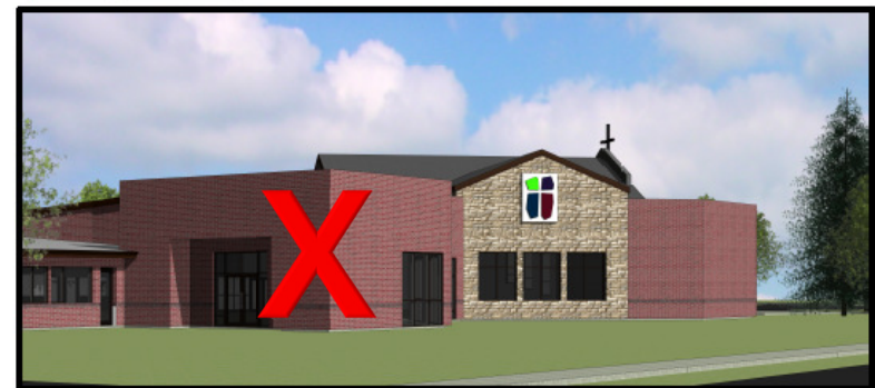
1 PERSPECTIVE #5