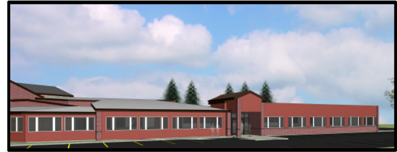
5 PERSPECTIVE #9