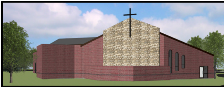
4 PERSPECTIVE #8