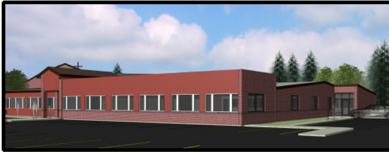
6 PERSPECTIVE #10