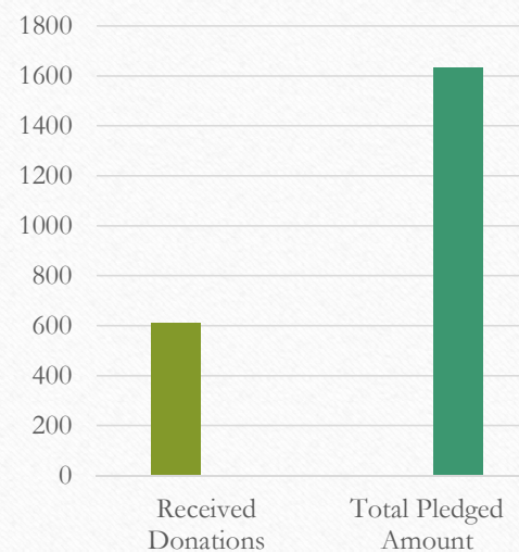
Received Donations and Pledged Amount, $K