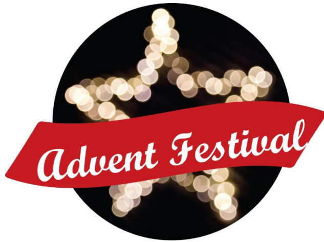
Table hosting means that you pick a craft or other type of project to set up at a round or rectangular table for the event on November 20th from 9:45-10:45 . The projects should be of an Advent or Christmas theme. You can set up your table project anytime from Friday afternoon through Sunday morning. Tables will be set up Friday after 12 pm and labeled for each table host for their project. All you need to do is get the supplies (we have many supplies in room 4W and we also can reimburse for supplies you need), make a sample, set up your project, be at your table

to help participants do the project from 9:45-10:45 am on Sunday, and clean up your project at the end. Pretty fun and simple! Contact Pastor Leta leta@our-saviours.org or 484-3133 if you are willing to host a table! You can come up with your own project or she will give you an idea!