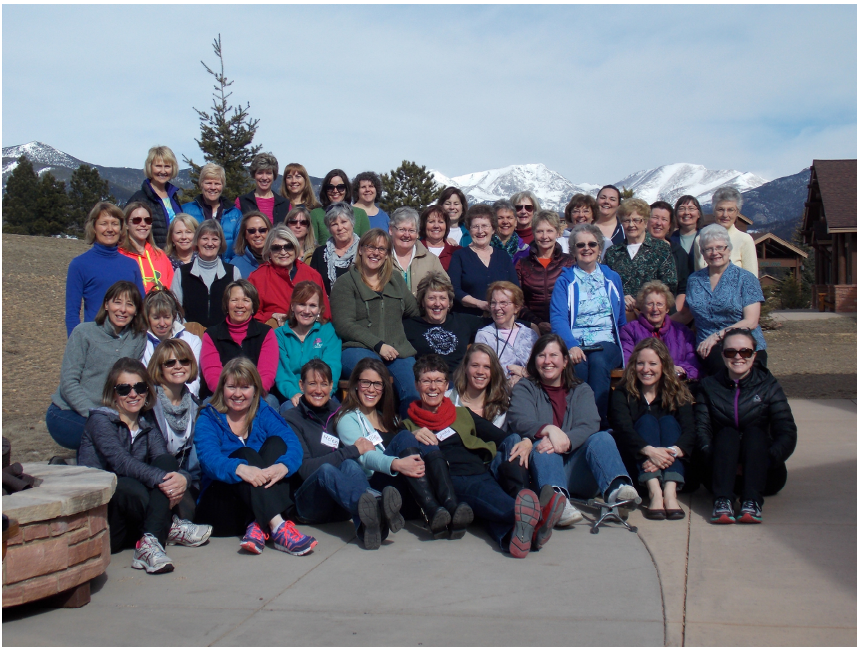
2014 OSLC Women's Retreat YMCA, Estes Park, CO

Proceeds Benefit Sky Ranch Lutheran Camp