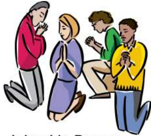
Joined in Prayer